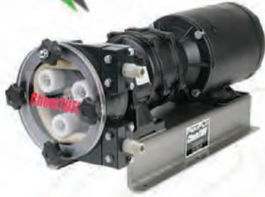
CT Series - Performance Curves