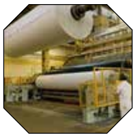
Pulp & Paper