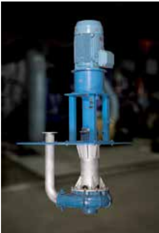
Vertical slurry pumps