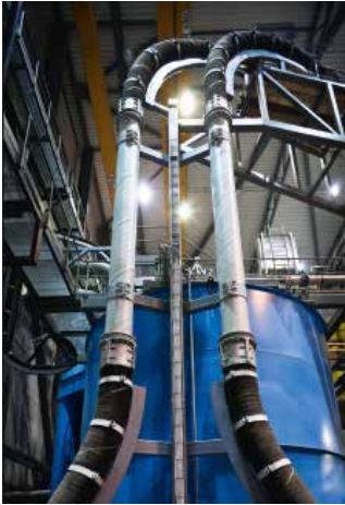
Hose and pipes